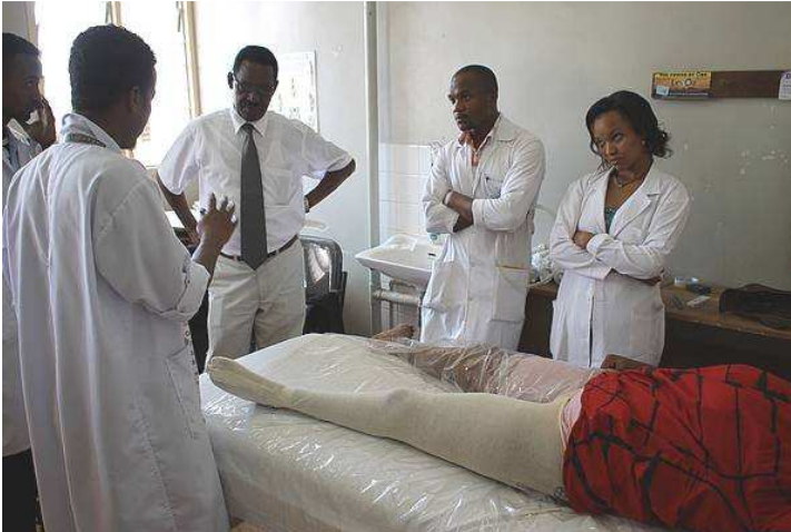
Fig-4 Consensus on Prescription of Rehabilitation Measures

Clinical/Practical Instruction is the foremost basic instruction which is carried out to ensure that both students and other members of the rehabilitation team are conversant with: