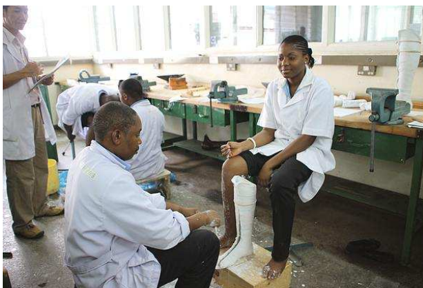
Fig-7 Workbenches installation

Workbenches should normally be between about 1.5 and 2 m long and about 0.6 and 0.8 m wide. To prevent the worker from having his back bent continuously while performing an operation, the height of the working surface should be about 0.9 m, (Fig-7).