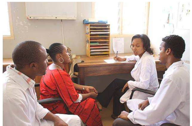
Fig-3 Members of Clinical rehabilitation team

The center's competencies are to continuously develop and apply innovative training and rehabilitation measures and methods to benefit the professionals, trainees and patients/clients. It also works in collaboration with different members of rehabilitation team, i.e. Patients/Clients, Orthopaedic Surgeons, Physiotherapists, Occupational Therapists, Social Workers, Prosthetists/Orthotist ( Fig-3 ), Universities, and Research Departments etc. to ensure high quality of training and service delivery is achieved.