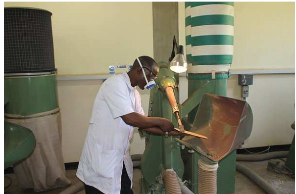
Fig-6 Safety Measures on Machines

Workbenches and machines should be positioned with attention to the purposes and frequency of use. They should consider both efficiency and safety. For example, a machine that is frequently used, such as a bench drill press, should be conveniently placed relative to workbenches so as to avoid unnecessary movement by the operator. Similarly, a machine that is potentially dangerous, such as a route, should have adequate space around it, both for the operator and others who may be passing from one part of the workshop to the other.