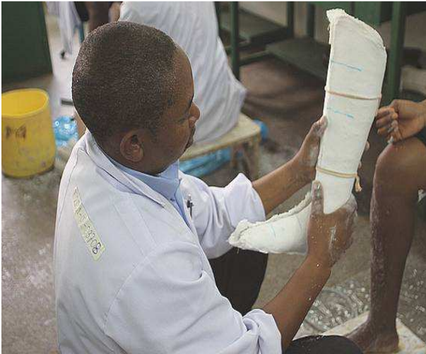
Fig-2 Orthopaedic Clinical Area